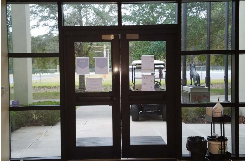
Gaps in doors caused by destabilization of the building slab.