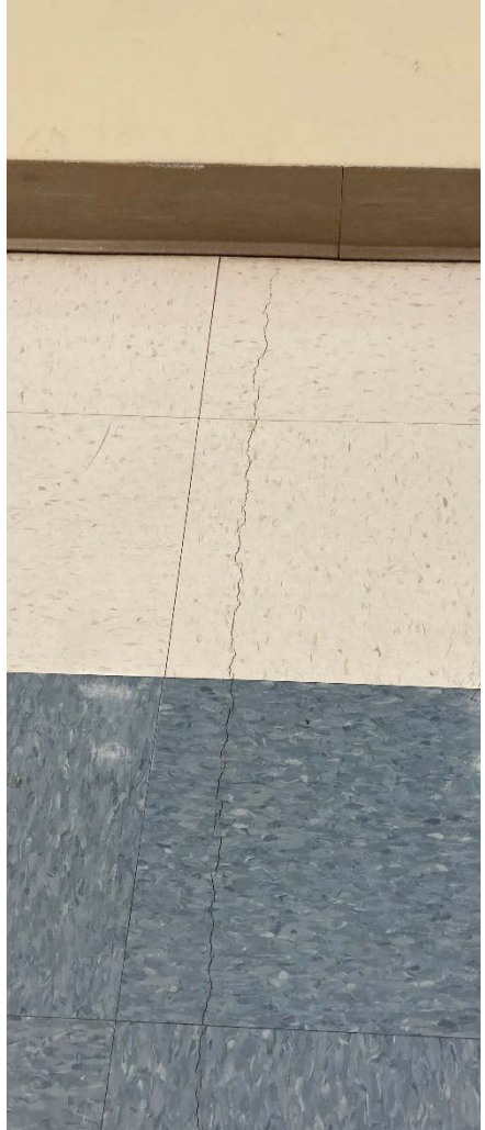
VCT tile cracking (condition typical throughout building