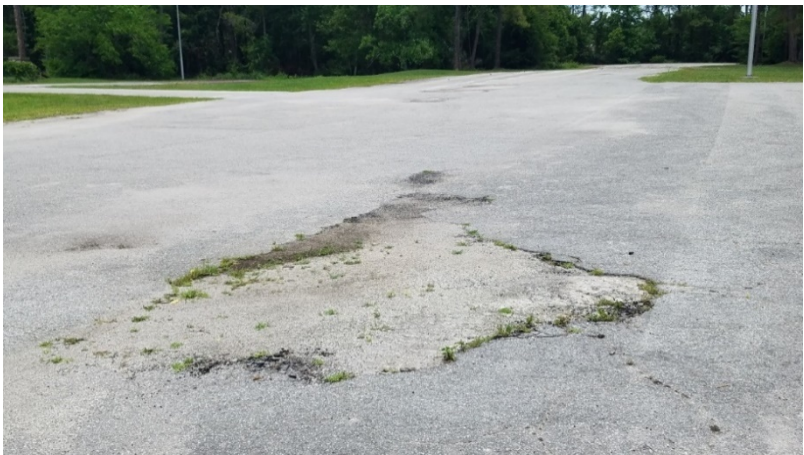
Emergency Vehicle Driver Training Track

The "road course" of the EVOC track is used to train students how to safely maneuver large vehicles through a simulated road course. Students learn how to approach a curve/turn and accurately position vehicle on the road to enable the vehicle to safely track through the curve/turn and have the rear portion of the vehicle not track off of the course (trail over). This is a vital skill for students to learn so they can safely operate through city streets and neighborhoods. This is especially true for operators of articulated ladder fire trucks and semi-trucks. This training cannot be done on public streets unless the streets are closed off to the public.