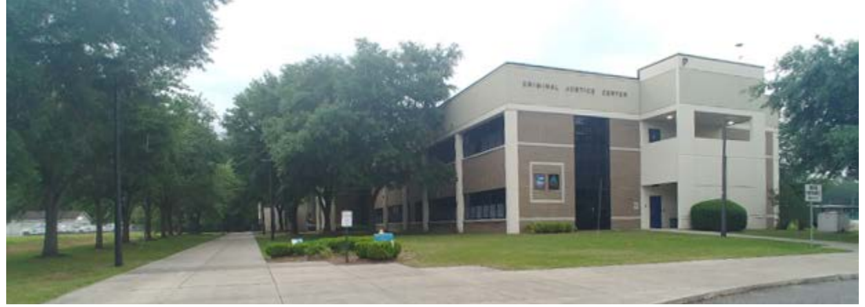
Criminal Justice Center, Building P, North Campus

certified driving track to be a sanctioned police training facility. The asphalt should be milled, and new asphalt applied.