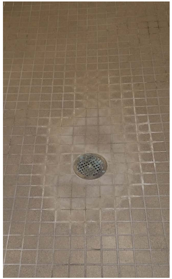
Shower drain repair caused by destabilization of slab