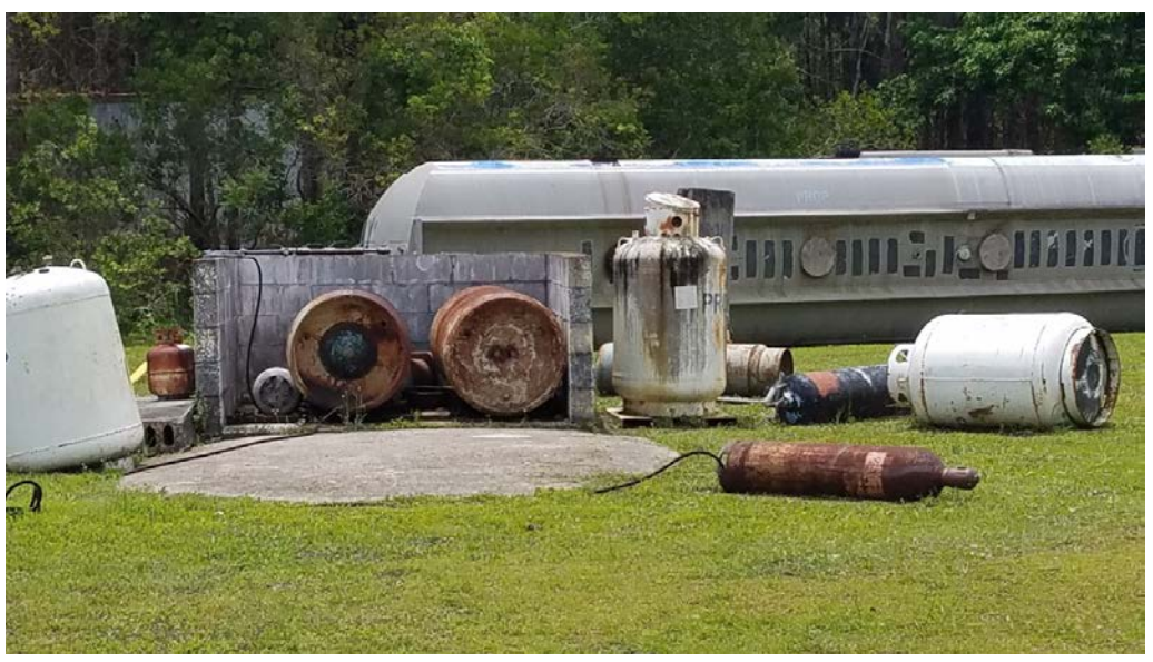
Haz Mat Prop