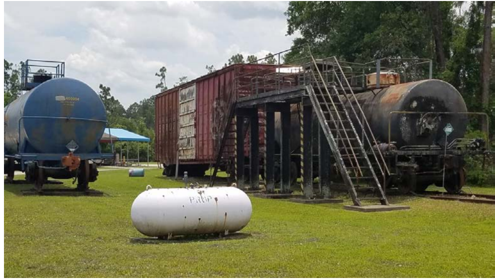
Haz Mat Prop

HazMat training is a specialized course designed to teach fire fighters how to safely mitigate the dangers of an incidents involving hazardous materials. Having the ability to simulate an incident brings real world training to the fire fighters. The Fire Academy has multiple HazMat props. The largest being a "tanker" railroad car. This railroad car is outfitted with valves and hoses to simulate leaking hazardous materials. The railroad car is outfitted with external stairs to allow fire fighters to safely reach the top of the railroad car. A portion of the stair rail and platform has rusted and is not safe for student to use that set of stairs. The handrail needs to be replaced. All of the HazMat props are showing signs of rust, especially the railroad tanker car. The HazMat props should be sand blasted and painted with a rust resistant paint to extend the life of the props. All HazMat props are currently operational, however all air hoses and valves should be inspected and possibly replaced. It is unknown if or when this has been completed in the past.