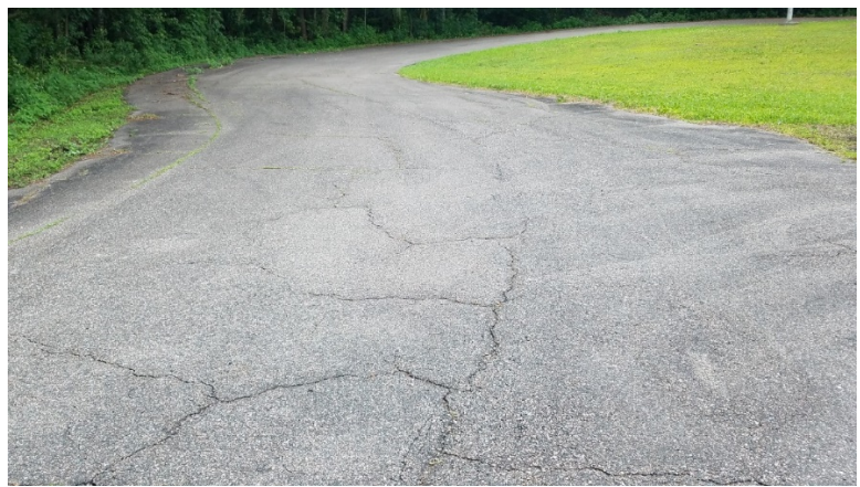
Emergency Vehicle Driver Training Track (condition typical throughout track)