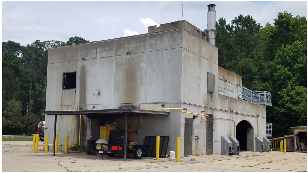
Burn Building, Building-W4