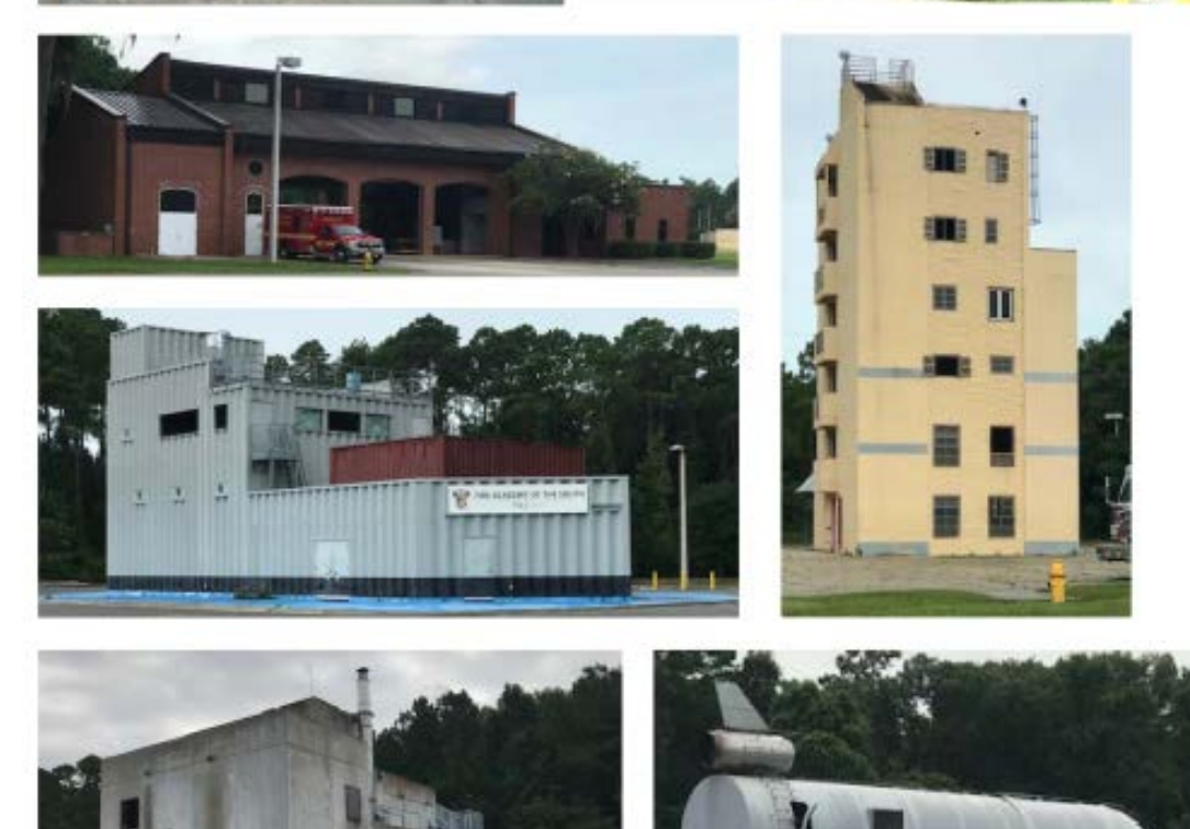
Props at the FSCJ Fire Academy, South Campus